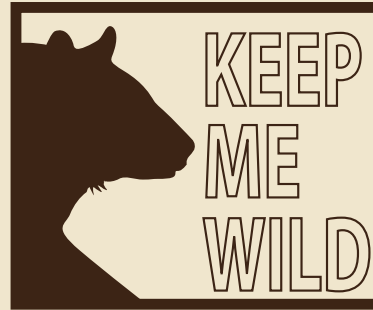
A campaign for all wild animals.